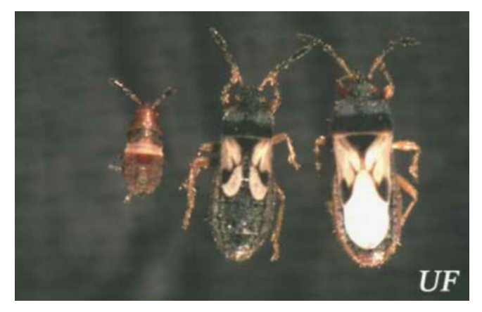
Figure 1. Nymph (left), short-winged (center) and long-winged (right) adult forms of the southern chinch bug.

Tiny eggs are laid singly or a few at a time in leaf sheaths, soft soil, or other protected areas. The eggs are white when first laid and turn bright orange just before hatching. Depending on climate conditions, eggs hatch in about 10 days and nymphs mature in about 3 weeks. Young nymphs are reddish-orange with a white band across the back, darken in color as