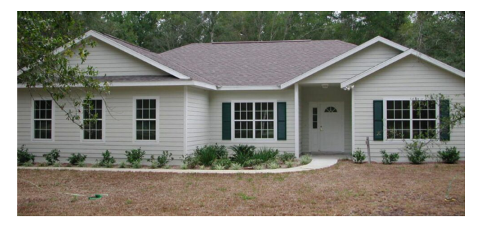
Figure 3. St. Augustinegrass yard killed by southern chinch bugs.