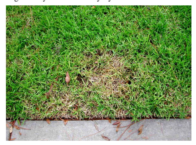
Figure 2. Patch of St. Augustinegrass killed by southern chinch bugs.

stolons of grasses with their needle-like mouthparts. This causes the grass to turn yellow and die. The insects tend to feed in groups, so dead patches of grass appear and seem to get larger as the chinch bugs spread through the grass (Figure 3). Southern chinch bugs mainly walk and rarely fly.